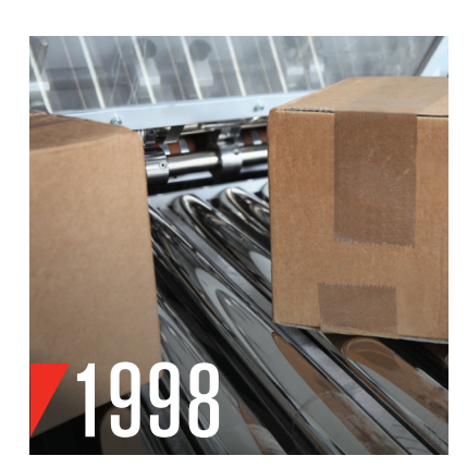
Acquired L.A. Sinotech and established a distribution center in California.

Purchased assets of Intermarket Imports, Inc. and expanded head office and distribution center into a 28,000 sq. ft. facility in Guilderland, NY.