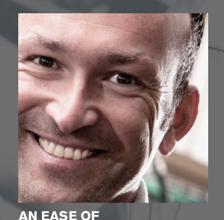
DOING BUSINESS We strive to be the easiest company that our customers do business with in any industry.

WE PLACE THE CUSTOMER EXPERIENCE ABOVE ALL ELSE. WE SUCCEED AT HELPING DISTRIBUTORS ENHANCE THEIR PRODUCT OFFERING WHILE MAINTAINING THE ABILITY TO PROVIDE CUSTOMERS WITH COMPETITIVELY PRICED, QUALITY SAFETY PRODUCTS.