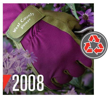
West County Gardener® consumer glove brand and business acquired.