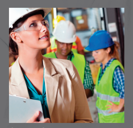
OUR PEOPLE We employ people trained and experienced in the business and recognized among the best in the industry.