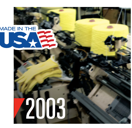
Acquired PRI Industries – a US manufacturer of specialty seamless knits.