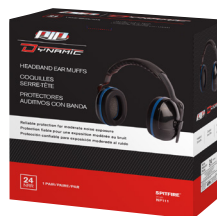
PIP® DYNAMIC® EAR MUFFS