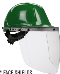
PIP® FACE SHIELDS

Can be logoed individually shrink wrapped or bagged