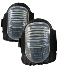
PIP® ERGONOMIC PRODUCTS