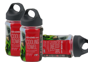
PIP® COOLING PRODUCTS