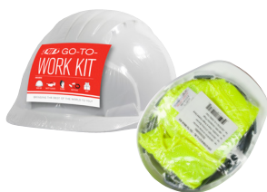
GO-TO-WORK™ HARD HAT KITS