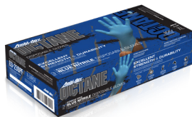
AMBI-DEX® DISPOSABLE GLOVES