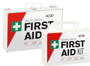
PIP® FIRST AID KITS