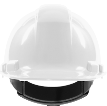
PIP® DYNAMIC® HARD HATS

Can be logoed individually shrink wrapped or bagged