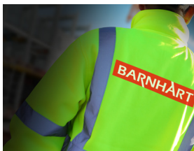
SPECIALTY PROTECTIVE GARMENTS

Can be assembled and individually packaged